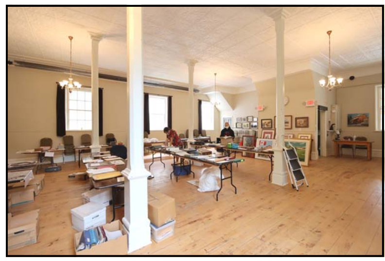
Sorting our Archives

summer, it became the ideal location for the archives and artifacts project. Our collections are located on the 2nd floor of the OTH. With the main hall empty, it was the perfect space to set up tables to provide a nice wide open workspace, where social distancing was easy to maintain. We created a list of COVID-19 protocols such as proper hand washing, use of separate washrooms, mask use and sanitizing any shared work areas in order to keep our students and our