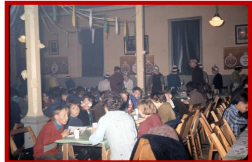
Students enjoying pancakes at the Old Town Hall, 1967

In the beginning, the festival was a three-day event held in March at which thousands of pancakes smeared with Leeds County butter and flooded with fresh local maple syrup were served to busloads of students on school trips and visitors from communities throughout Eastern Ontario. To keep up with the crowds, meals were served on both floors of the Old Town Hall. Visitors were able to tour 15 local sugar bushes along with watching maple syrup being bottled and maple candy being made in the Confederated Foods / United Maple Products building.